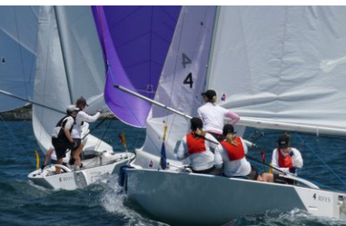
Above, sailing the Elliott 6m's on Lake Michigan and the facilities of Sail Sheboygan and the Sheboygan YC.