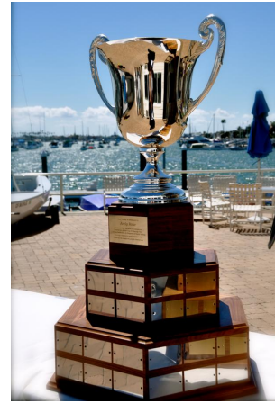
The Rose Cup

So far, it has exceeded beyond the expectations of its founders. Rose Cup alumni have already distinguished themselves in both youth and open match and fleet racing events worldwide.